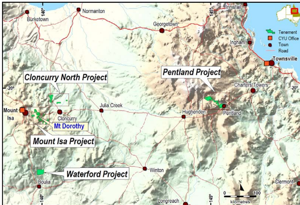
Figure 1. Australian Projects of CYU. Cloncurry North and Waterford Projects consist Ernest Henry style copper gold targets and sedimentary uranium targets at Malakoff and Waterford.

YEX and CYU have an initial 60 day period in which to acquire their related regulatory approvals.