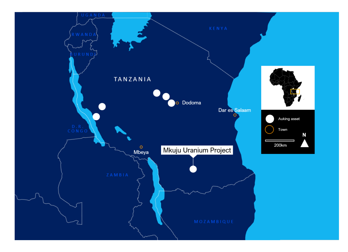
Figure 1 – Mkuju Project Location

"These initial results from this program establish Mkuju's case as a major target for uranium mineralization and we look forward to what the rest of the program reveals over the coming weeks. We will continue to carry out preliminary pXRF and spectrometer measurements on the drilling and other samples prior to their dispatch for assay," he said.