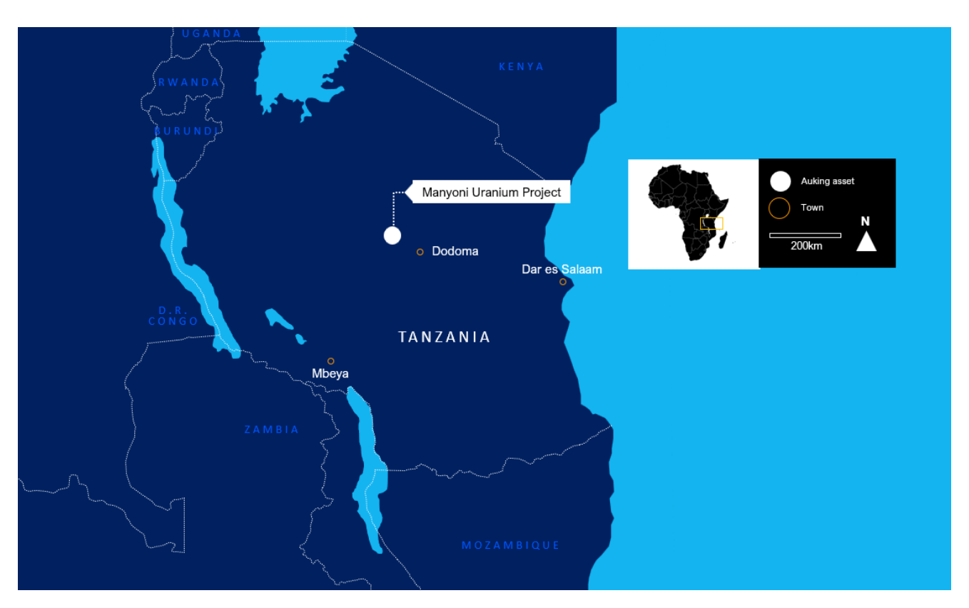
Figure 1 – Manyoni Project Location

Manyoni had been the focus of activities of UNX from the early 2000's up until 2013. The Fukushima disaster in 2011 had a dramatic impact on the uranium market and UNX's apparent focus turned to graphite interests in the region.